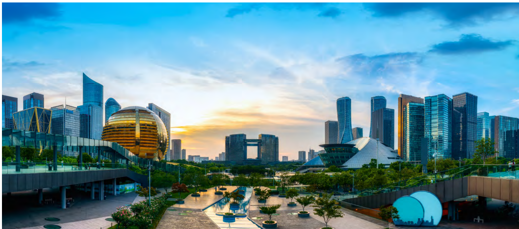
Financial district in Hangzhou.

The other alarming consequence of constant surveillance is the direct threat to communities and individuals , rather than just to states. On a personal level, the constant vacuuming of personal data leads to microtargeting opportunities for a nefarious actor, such as locking or emptying a bank account, tanking an economic credit score, feeding personalized advertisements and dis/misinformation messages, blackmail, and possibly even directly damaging a connected home through hacking smart devices.