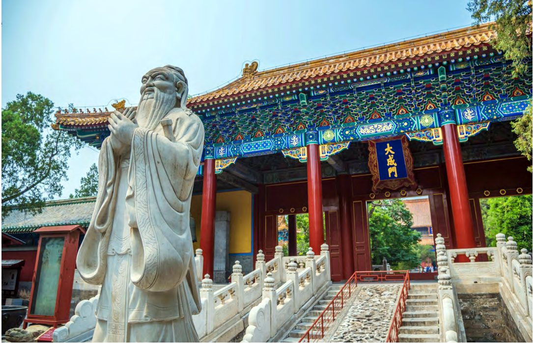
Temple of Confucius in Beijing

To President Xi, the idea of harmony describes a greater social order with China at the core. The U.S. Department of State argues, “Xi’s community of common destiny for mankind would replace the established international order grounded in free and sovereign nation-states with a unity of nations in shared deference to the CCP’s conception of international order.” 36