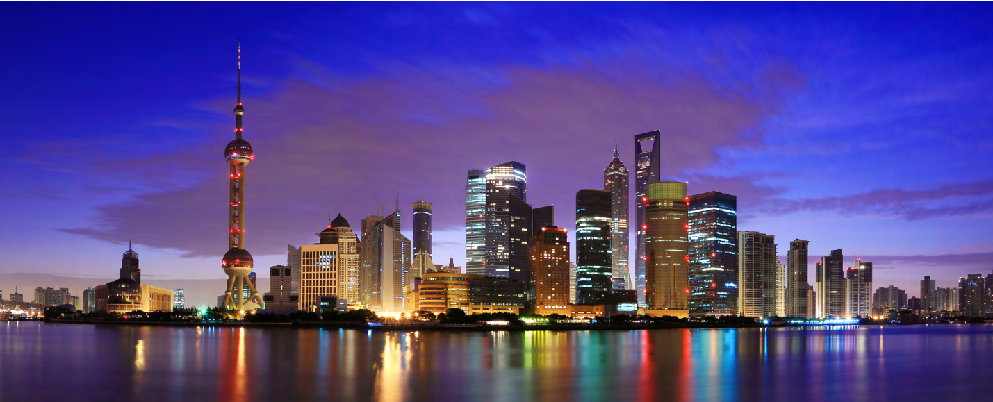
Lujiazui financial zone in Shanghai.

By 2035, China will have surpassed the U.S. as a world power.