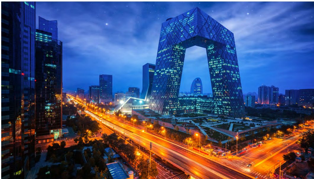
Beijing Central Business District.

A key component of China's successful economic narrative is making Chinese goods and investments appear not only acceptable but desirable to the alternatives. Marketing of Chinese high-tech products, particularly those related to telecommunications and mobility, leans heavily into futurism—they are the products of tomorrow, available today, and for cheap. OPPO's new phones, for example, do more than provide value to end users; they “empower people to ... unleash their imagination of the future; thereby helping everyone get the best out of life.” 18